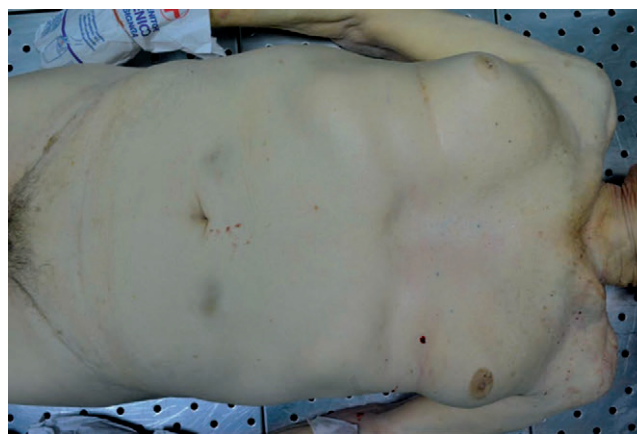
Figure 2. Gynecomastia of the man.

the detection of small testes associated with tall stature. In this case, a DNA test was performed in order to confirm the genetic abnormality. By pathological examination were observed sclerotic tubules and hyaline, with the presence of germ cells and sperm.