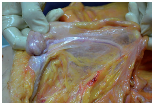
Figure 4. Testicular dysgenesis with right cryptorchidism.