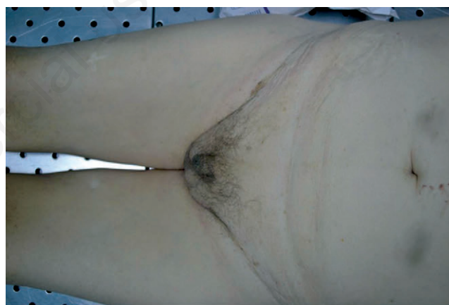
Figure 3. Hypogonadism and micropenis of the man.