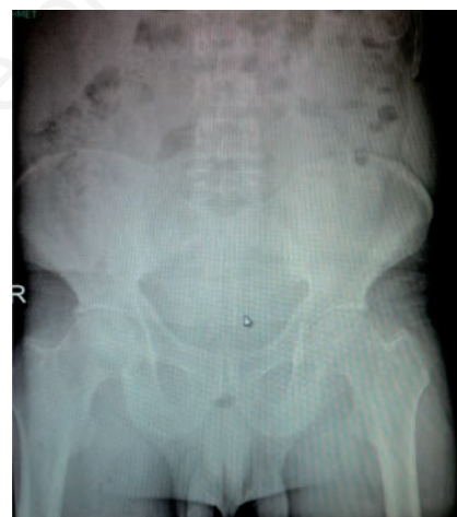
Figure 1. X-rays performed to rule out perforation.