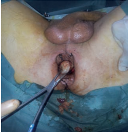
Figure 4. Rongeur used during the operation.