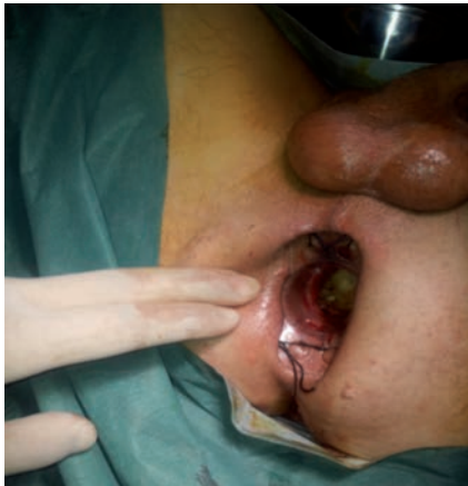
Figure 3. Anoscopy inserted into anal canal and fixed to perianal skin.