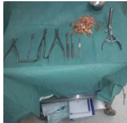
Figure 5. Cutting instruments used to extract the radish.

and there was risk of sphincter damage and intestinal injury. So we did not remove just with corkscrew. Since the radish was low lying located and easy to cut, we decided to remove it cutting into small pieces. Despite the above mentioned precautions, injuries on intestinal walls may occur. We believe that the attention the surgeon shows will minimise this risk. Clark and others used corkscrew to remove a dildo. 9 Kasotakis and colleagues reported a case with pubic symphysiotomy due to extraction of foreign body. 10 Glaser and colleagues used argon plasma coagulation to remove an apple in rectum. 11