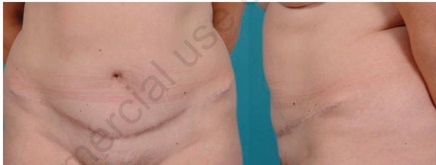
Figure 2. Result 18 months after implantation of an Alloderm® prosthesis. Frontal view (left). Lateral view (right).