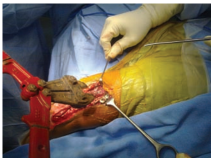
Figure 2. Cutting the plate on both sides of the hole using a metal cutter.