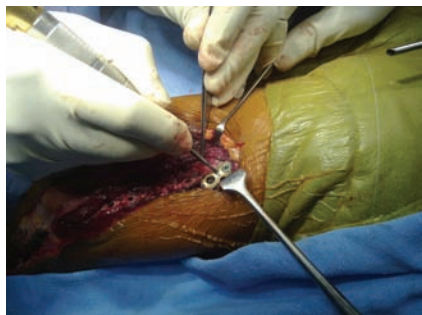
Figure 1. A high-speed metal cutting saw being used to cut the plate on both sides of the locking hole.

Pattison described the use of a foil between the screwdriver and screw head. 7 But this is not helpful in the removal of jammed screws. An attempt can be made to use conical extraction screws but failure rates with their use is