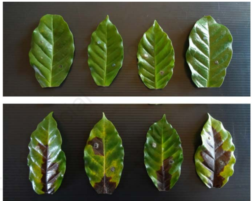
Figure 3. Pathogenicity test of C. gloeosporioides causing anthracnose of coffee, upper = non-inoculated control and lower = inoculated with pathogenic isolate.

Anthracnose of coffee var. Arabica proved to be caused by C. gloeosporioides as previously reported by Vilavong et al. 6