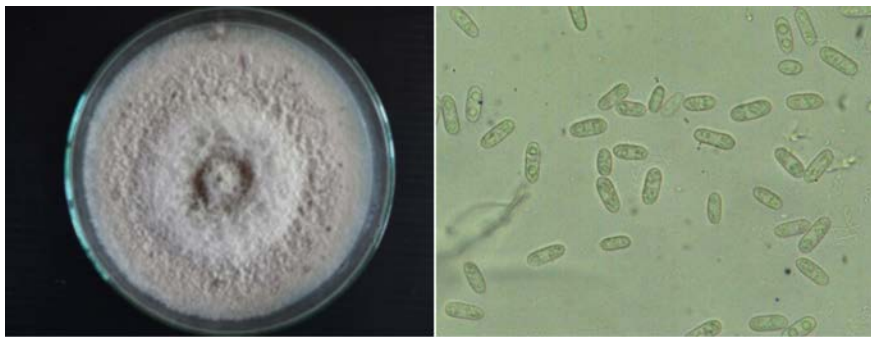
Figure 1. Culture of Colletotrichum gloeosporioides causing anthracnose of coffee on PDA for 15 days, right = pure culture and left = conidia.

C. gloeosporioides causing anthracnose of coffee was cultured on PDA for 15 days