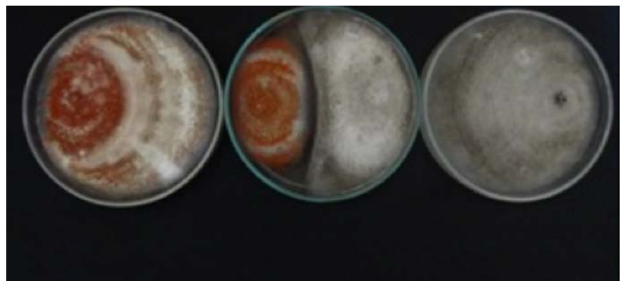
Figure 4. Dual culture test between C. cupreum CC3003 and C. gloeosporioides , right = C. cupreum CC3003, middle = dual cultures and left = C. gloeosporioides .