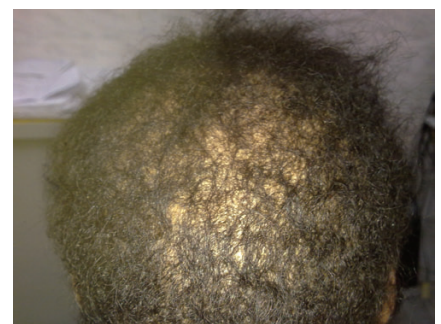
Figure 2. Hypotrichosis in the second patient.