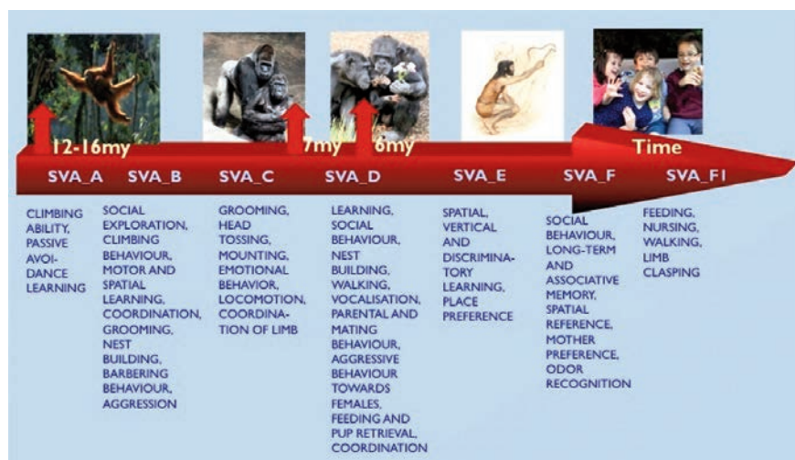
Figure 1. Behavioral categories attributed to genes associated with SVA insertions at different periods during evolution.