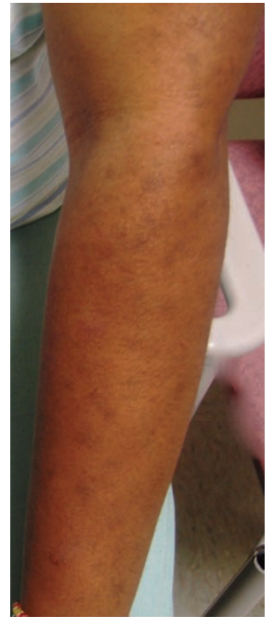
Figure 3. Clinical presentation on follow-up visit.

©Copyright T.W. Blalock et al. , 2010 Licensee PAGEPress, Italy Dermatology Reports 2010; 2:e10 doi:10.4081/dr.2010.e10