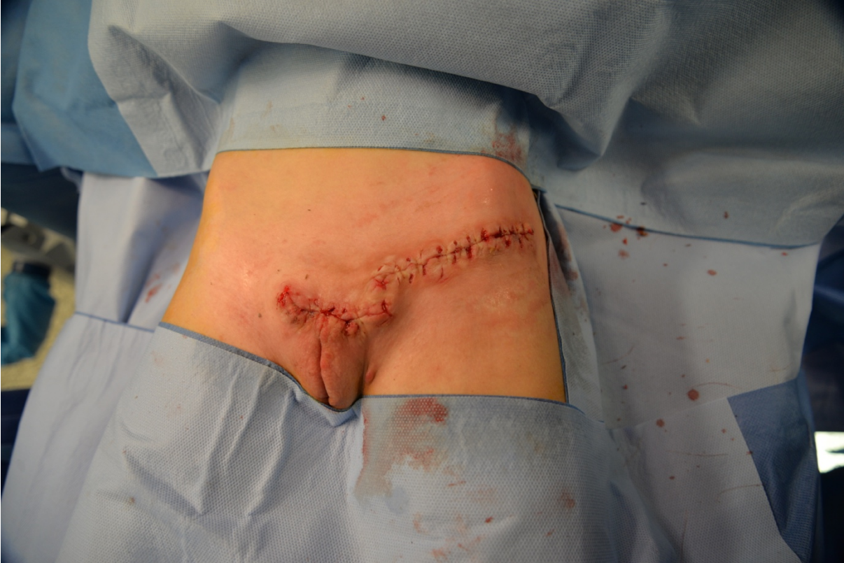
Figure 4. Left groin and pube wounds after complete excision was performed.