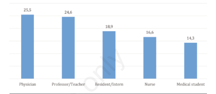
Figure 1. The photographer title preferences.