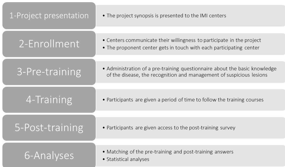
Figure 1. Name and description of the MelaMED programme phases.