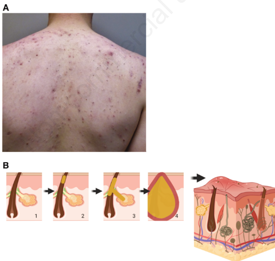
Figure 1. The pathophysiology of acne. A A case of severe acne on the back; B 1) in the healthy pilosebaceous unit, egress of sebum from the hair follicle occurs without restriction; 2) formation of a plug through complex interactions between hair follicle cells, sebum and C. acnes blocks the pore; 3) this in turn supports C. acnes proliferation and drives sebum and bacterial accumulation in the follicular canal; 4) the surfeit of material in the pilosebaceous unit eventually causes the rupture of the follicular canal, triggering the inflammation that presents clinically as acne swellings. Created in BioRender.

The pathophysiology of acne, which has been summarised elsewhere, 16,37,38 centers on the effects of C. acnes on the pilosebaceous unit (PSU), as depicted in Figure 1. The name “pilosebaceous” derives from the Latin plius for hair, and sebum for grease. 39 The PSU consists of a hair follicle and sebaceous gland as the minimal unit, along with the arrector pili muscle. The sebaceous gland provides a lipid-rich environment in which C. acnes can thrive given it is an anaerobic bacterium that can degrade triglycerides in sebum to release free fatty acids that support bac-