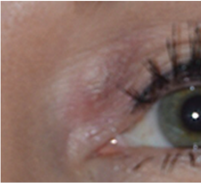
Figure 1. Organized cyst on the medial aspect of the left upper eyelid 9 weeks following upper blepharoplasty.