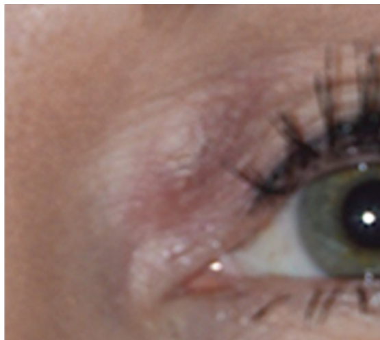
Figure 1. Organized cyst on the medial aspect of the left upper eyelid 9 weeks following upper blepharoplasty.

ed Gordonia Bronchialis , an Actinomycete. No susceptibility data was available.