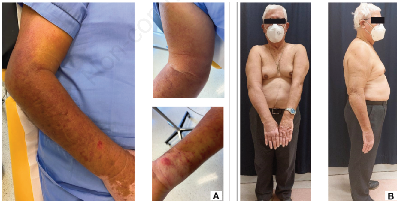
Figure 2. A) Patient's right arm. Note the arm size, which was more than twice the contralateral, causing the patient difficulties in flexing the arm and swelling, with the appearance of orange peel skin; B) patient after six months of treatment with methotrexate and the use of the elastic compression device. Note the significant reduction in the volume of the affected arm and the skin appearance, now much more similar than the unaffected one.