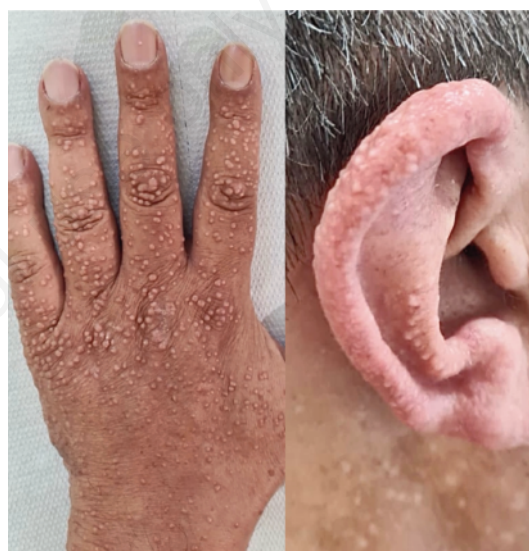
Figure 2. Smooth papules of left dorsal hand prior to the therapy.