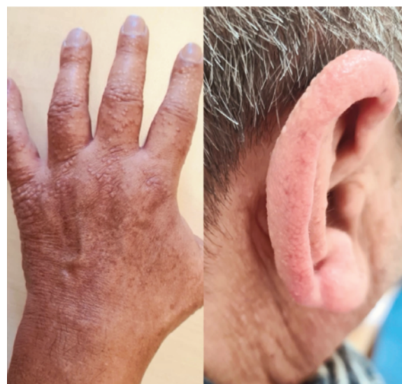
Figure 3. Clinical improvement after 6 months of therapy.