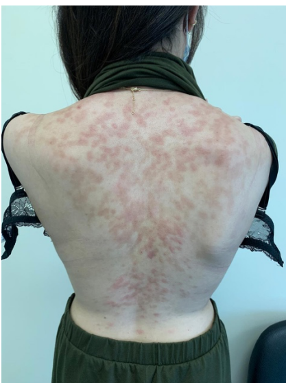
Figure 1. Erythematous plaque with a pale center that coalesces into larger archiform plaques and resolves with hyperpigmented patches in Christmas tree configuration.