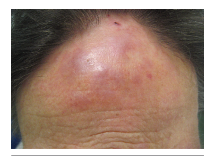
Figure 1. Primary cutaneous follicle center lymphoma. Clustered erythematous papules and plaques on the forehead.

The fourth edition of the WHO classification has categorized PCMZL within the broader category of extranodal marginal zone lymphoma. PCMZL are low-grade lymphomas running an indolent course, with an excellent prognosis (the five-year survival rate is around 99%). Typically, PCMZL presents during the fifth or sixth decade of life, although there have been reports of patients as young as 15 years old. Men are diagnosed with this condition roughly twice as frequently as women. The vast majority of cases of PCMZL occur in Caucasian individuals. PCMZL typically presents with erythematous to violaceous papules, plaques, nodules, or tumors on the skin (Figure 2A). Ulceration is atypical, but peri-lesional annular or diffuse erythema may be present. These lesions may be solitary or multifocal; in contrast to PCFCL, presentation with multifocal skin lesions is not uncommon. PCMZL