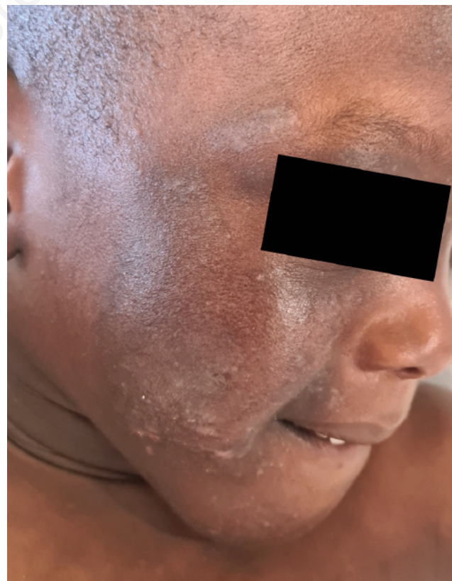
Figure 3. Resolution of the cutaneous rash after griseofulvin therapy, leaving disfiguring scar tissue.

In conclusion, pruritic, annular macules not responsive to immunosuppressants should always raise the suspicion of tinea incognita, which must be investigated and ruled out to avoid infection persistence. Indeed, neglected superficial dermatophytosis could also possibly invade hair follicles and deeper tissues and cause permanent scarring, which must be prevented.