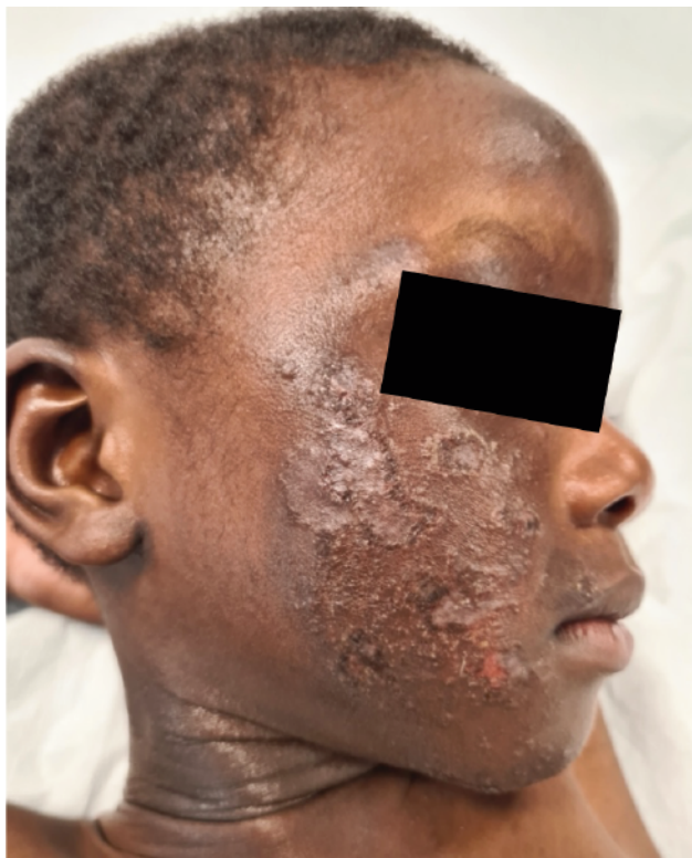
Figure 1. Annular, pruritic macules on a 4-year-old boy with a cracked surface and crusted, raised borders slowly enlarging.

Tinea incognita is a dermatophyte infection of the skin, exacerbated by the administration of systemic or topical immunosuppressants such as corticosteroids and calcineurin inhibitors. 2,3