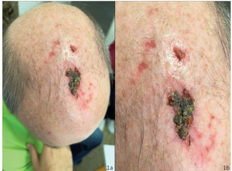
Figure 1. A,B) Clinical picture of a histopathologically proven form of erosive pustular dermatosis of the scalp with large erythematous, erosive and crusted patches with granulation on an atrophic skin with androgenetic alopecia.

options, since there are conflicting clinical observations in the literature that describe these two options as more of a triggering/inducing factor. 8,34-38