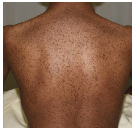
Figure 1. Multiple generalized dark brown macules over the back.

Publisher's note: All claims expressed in this article are solely those of the authors and do not necessarily represent those of their affiliated organizations, or those of the publisher, the editors and the reviewers. Any product that may be evaluated in this article or claim that may be made by its manufacturer is not guaranteed or endorsed by the publisher.