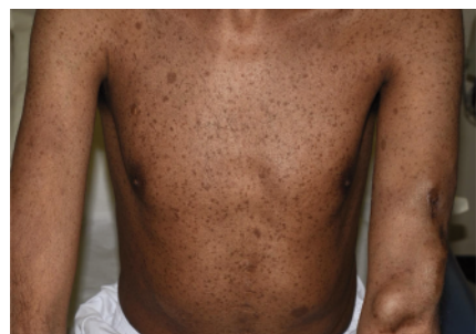
Figure 2. Generalized dark brown macules over chest, abdomen, and left arm. Note arteriovenous fistula on left arm.