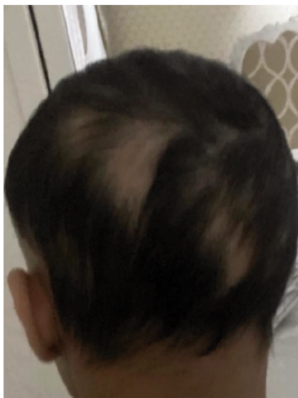
Figure 2. Patchy hair regrowth after the use of dupilumab.