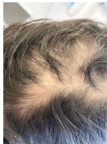
Figure 4. A solitary non scarring well defined alopecic patch expanding over the vertex of the scalp with few well detached fine scales.

and AT. 7-10 The improvement was noted after the few first doses in some reports, however most cases showed a significant improvement after few months of treatment. Hair regrowth was most noted in the scalp.