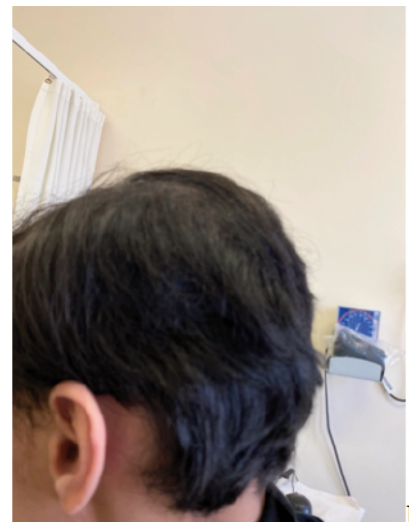
Figure 3. A), B) and C) showed significant hair regrowth after 4 months follow-up.