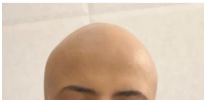
Figure 1. Full hair loss after discontinuation of Tofacitinib.

A 21-years-old female is known to have AD since childhood and AU for 9 years. Patient used topical treatments and narrow-band ultraviolet B phototherapy with limited improvement. Since the patient had limited improvement and multiple relapses of AU, tofacitinib 5 mg twice daily was considered. After starting tofacitinib patient had hair growth over the eyebrows, eyelashes, armpit, pubic, and most of the scalp sparing occipital and left lateral temporal areas of the scalp and lower limbs. After 7 months of tofacitinib use, patient experienced upper limb numbness and headache. Tofacitinib was discontinued and patient refused any previous treatment. Since then, she experienced full hair loss as shown in (Figure 1). Three months later, without medical advice patient used tofacitinib for only 2 months. Tofacitinib was discontinued again, and patient was started on dupilumab 300 mg subcutaneous injection biweekly for 9 months which showed an excellent improvement for both diseases after 2 months. On examination, patient had hair regrowth all over the scalp as shown in (Figure 2) and eyebrows, a few well-demarcated rounds to oval non-scarring alopecia patches over the scalp with partial loss of eyelashes hair. After four months follow up, the patient continued to have an improvement (Figure 3 A-C), with only one alopecic patch in the vertex (Figure 4).