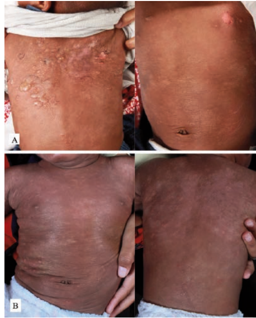
Figure 1. Clinical picture of the patient at initial visit: blisters and erosion distributed on the trunk (A), and the development of new urticarial plaques after blisters resolution (B).

Two weeks later, the symptoms were improved, but there were still new erythematous wheals on the back, face, and chest. During the examination,