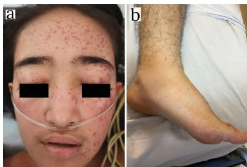
Figure 1. a) Angioma-like papules in a 21-year-old HIV-positive woman; b) Pinpoint erythematous papules with a pale halo in a 19-year-old male with non-Hodgkin lymphoma.

precise cause of these changes has not been elucidated, but it has been theorized that it might be a dermal hypersensitivity reaction to a viral particle or a direct viral effect on the vascular endothelium. 10 There are no specific laboratory findings. No specific treatment is required and lesions usually resolve spontaneously in one to two weeks. 9 In conclusion, Eruptive pseudoangiomatosis is a pathology not widely known and probably underdiagnosed due to the fact that it is self-limited. More studies are needed to establish a known etiology and associations.