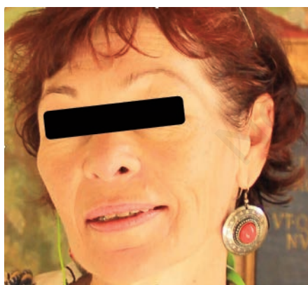
Figure 1. Patient's appearance before diagnosis of Lupus pernio.

In 1869 sarcoidosis was first described as a disease of the skin (papillary psoriasis) by J. Hutchinson, followed by Besnier in 1889, and in Boeck in 1899. It was not until the middle of the twentieth century that the term sarcoidosis was used. 1,8 The affected skin of the nose turns red, purple or violet because of the large number of vessels in the affected area. The disease is chronic, usually relapse in winter. Sarcoidosis is called the great imitator great mimicker due to the nonspecific clinical manifestations, which might correlate with a lesion of any organ, however it is often extrapulmonary