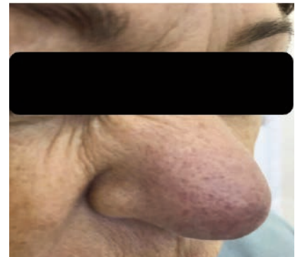
Figure 3. Patient's appearance after diagnosis of Lupus pernio.