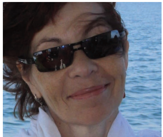
Figure 5. Patient's appearance on 1 year follow up.