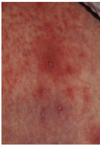
Figure 2. Tender erythematous papulopustular eruption of the proximal lower extremity.