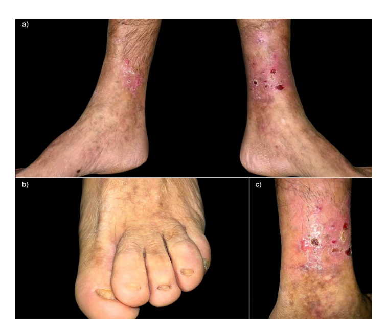
Figure 1. a) Pretibial bullous lesions on the legs, showing blisters and erosive areas; b, c) detailed view of scars, bullous blisters, pigmentary alterations in the left pretibial region, and nail dystrophy of the left foot.