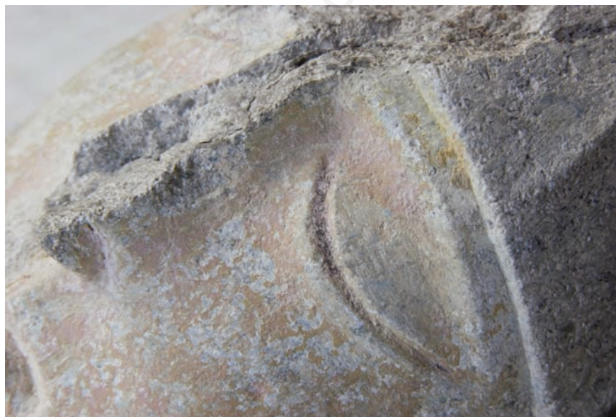
Figure 3. Head of the sleeping soldier (limestone, 16x9 cm) coming from the lintel.